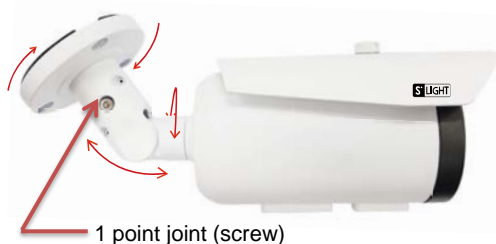
1 point joint (screw)